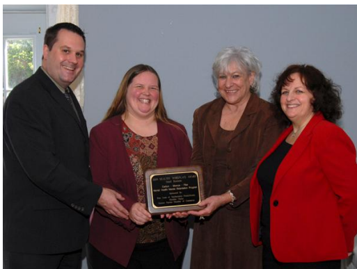
Award winner Carbon, Monroe, Pike MH/MR

Small Business (49 and under employees): Carbon, Monroe, Pike Mental Health/Mental Retardation Program , Large Business (50 and over employees): Shawnee Inn and Golf Resort . When asked, "What is your organization doing to promote a healthy workplace?"