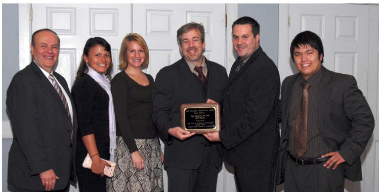
Award winner Shawnee Inn & Golf Resort

Shawnee Inn & Golf Resort reported that their employees can use Shawnee's indoor pool, tennis courts, and fitness center at no cost, along with hiking the trails, on and along the resort. They also receive employee discounts on the following amenity services; River Adventures, Shawnee Mountain, Golf, and Spa. Their employees can also take part in wellness activities such as 5K's and walks. Shawnee Inn is searching ways in which to partner with its health care provider to offer discount incentives for employees who join health clubs and smoking cessation programs. Shawnee Inn will continue to sponsor smoking cessation programs that the employees can join at no costs. In the event they complete the program, they are awarded with a $50 gift card. Both of these businesses need to be commended on their wellness programs that they have in place for their employees.