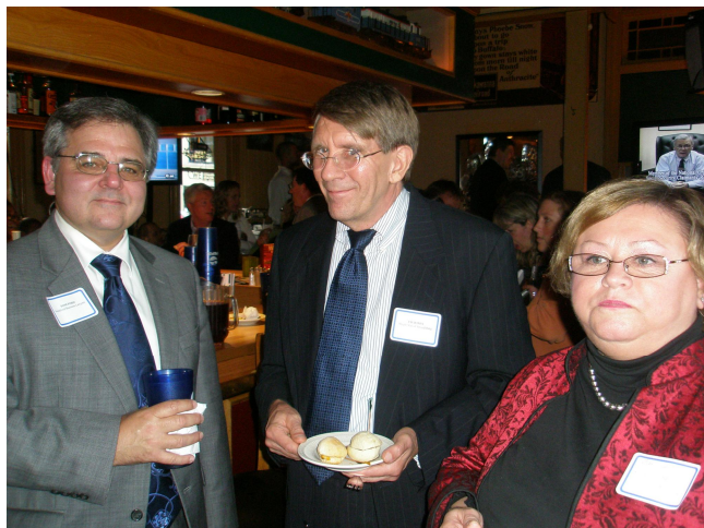
October Business Card Exchange at Dansbury Depot

The Business Card Exchange was held at the Dansbury Depot on October 5, 2009 and was very well attended with over 100 guests. Dansbury Depot provided an outstanding array of appetizers along with a pig roast.